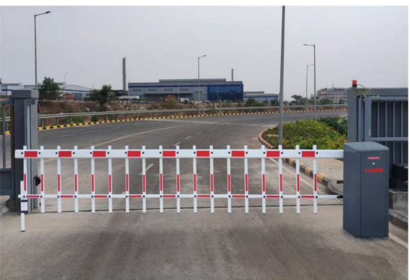
Note: Boom skirting can be provided upto 4.5 meters